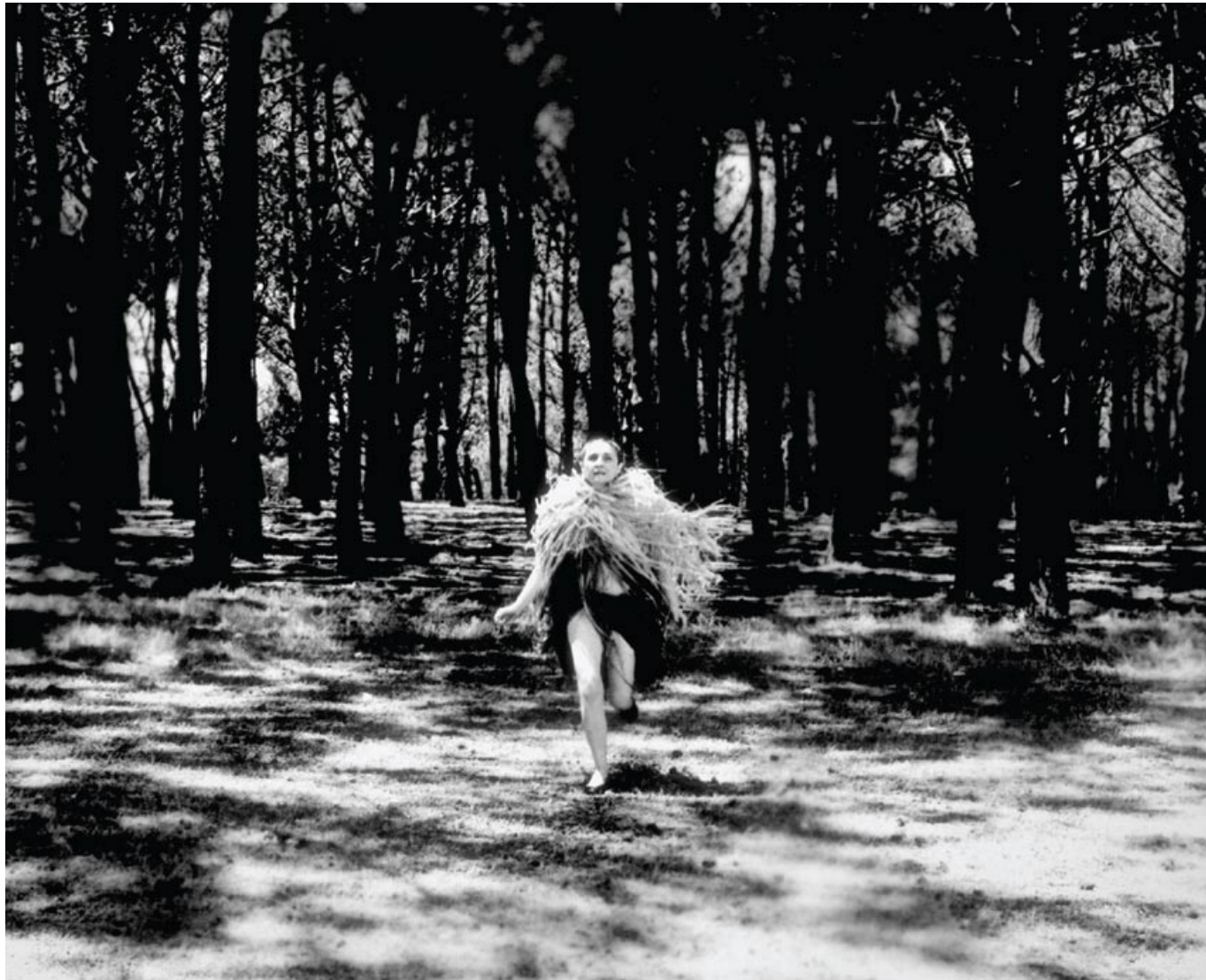
A Woman Runs, Ashley 2003 gelatin silver print | 50 x 60 cm