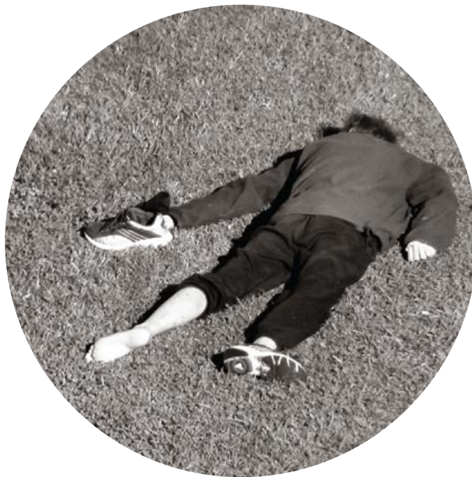
The Sleepers 2005-2008 (detail) lambda print | 20 x 29 cm

ISBN:978-1-921437-04-5