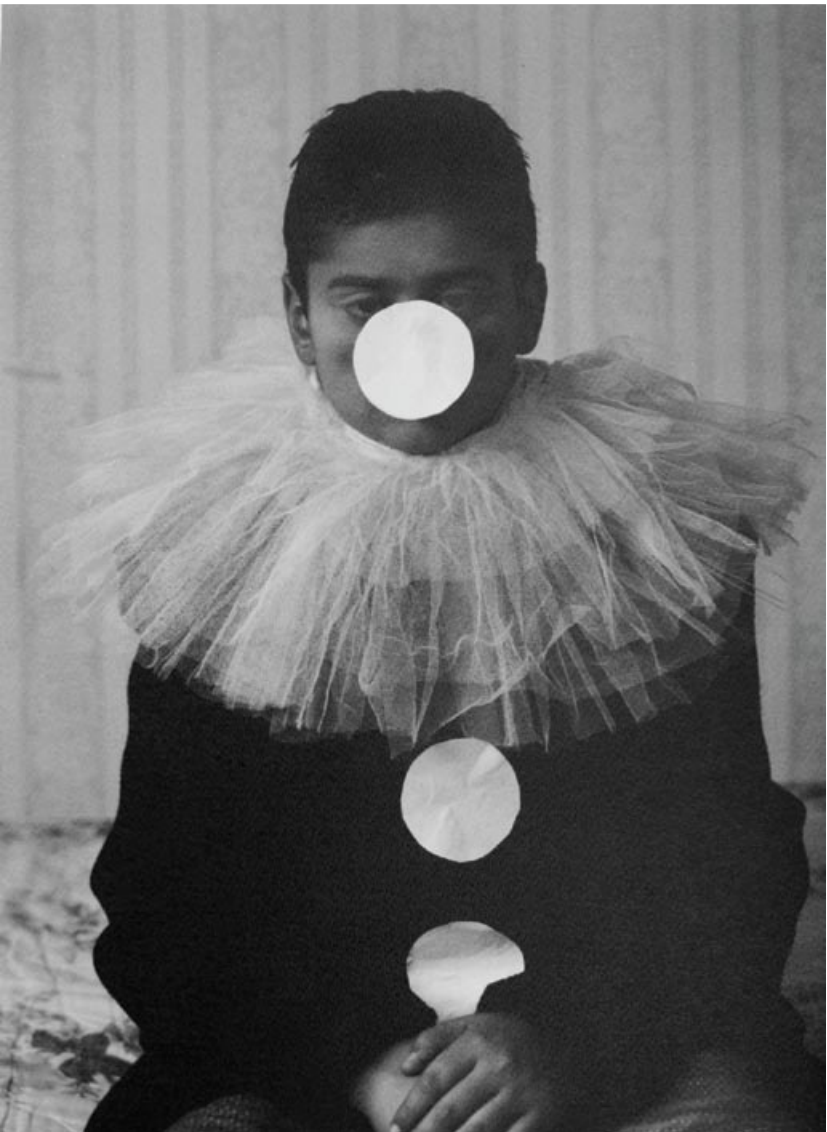
Tooti Tootoo 2000/2002 gelatin silver print | 40.5 x 30.5 cm

The Sleepers 2005-2008 20 lambda prints, 20 x 29 cm each