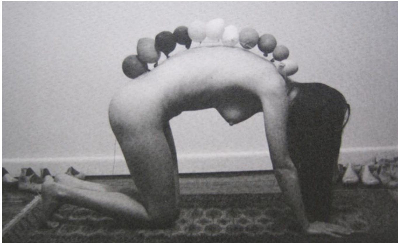
A Dinosaur for Peter B 2002 gelatin silver print | 9 x 14.7 cm