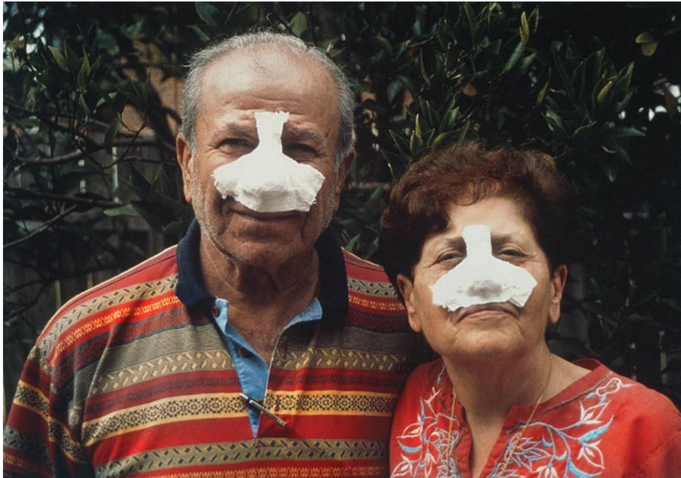
Operation Nose Nose Operation (Jido and Tera) 1999/2000 c-type print | 49 x 69 cm