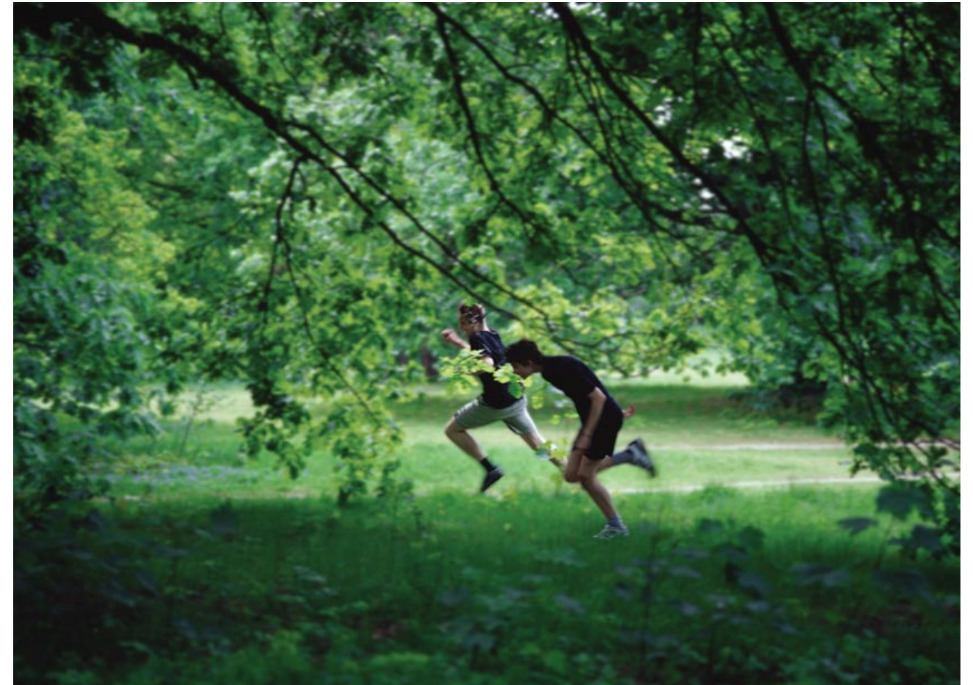
Looking Glass, Tiergarten 1 2004/2005 inkjet print on matt vinyl banner | 300 x 450 cm