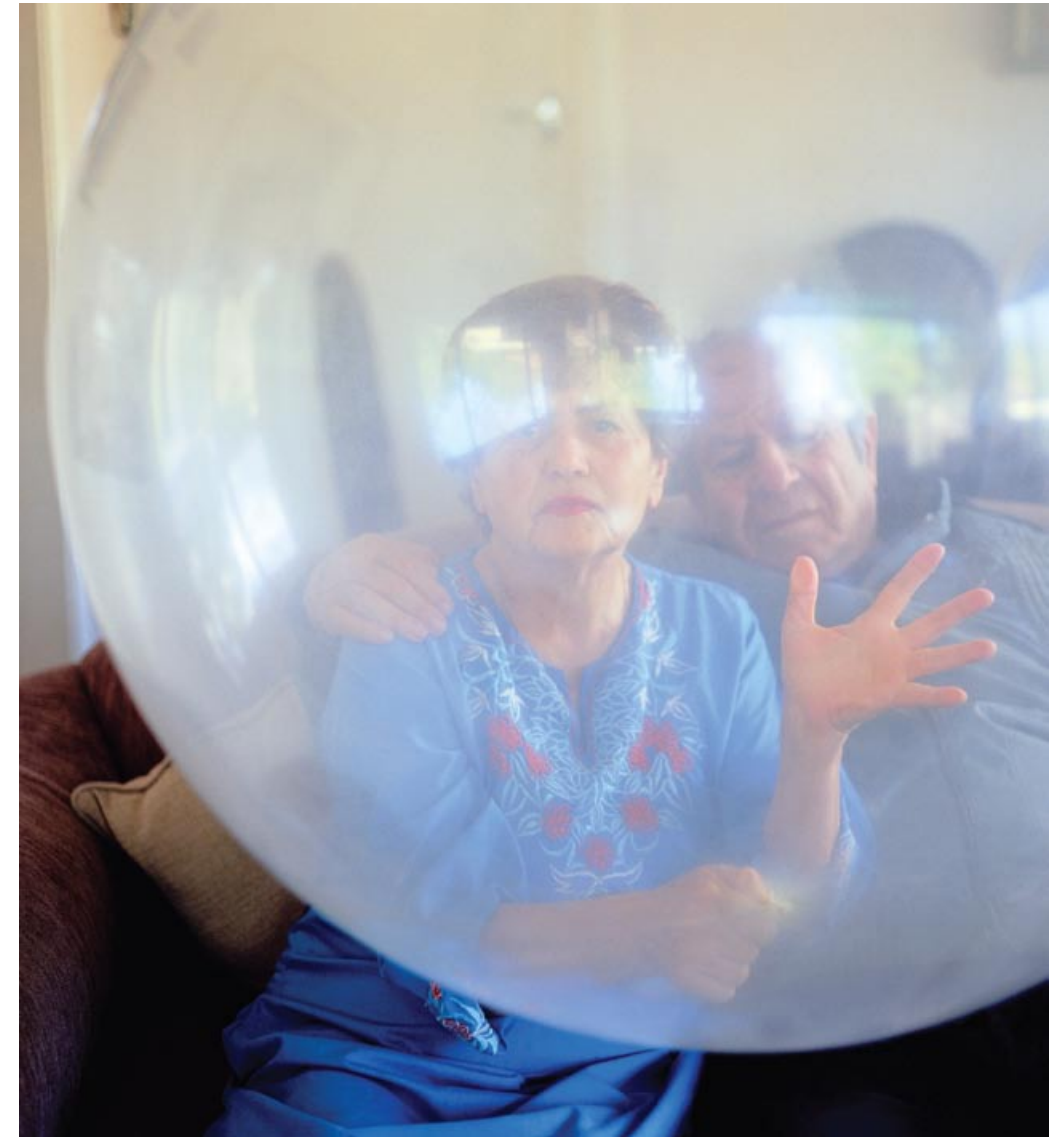
Tera & Jido (sleep) 2002 lambda print | 58.5 x 53.5 cm