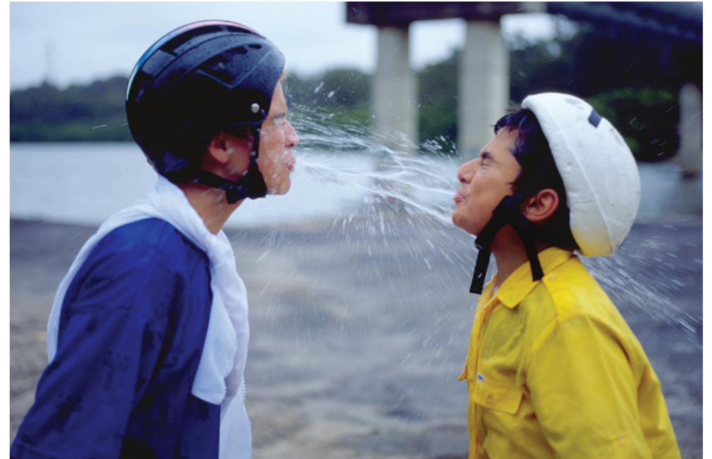
The Kiss 2000 c-type print | 47 x 71 cm